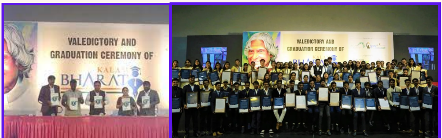
The Kalam Bharat programme Graduation Ceremony

The Kalam Bharat Programme Invitation will feature participation from graduates of Bhoj Reddy Engineering College for Women (BRECW).