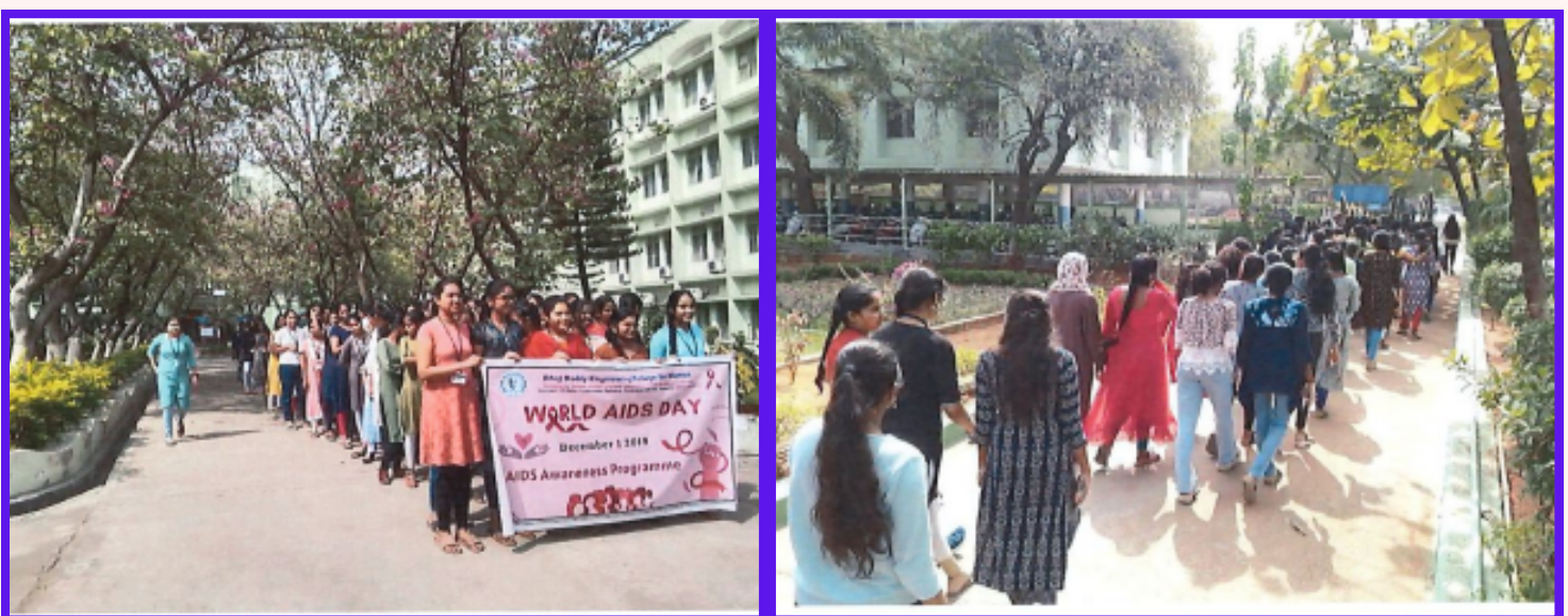
Students participated in a rally organized under the Unnat Bharat Abhiyan (UBA) initiative to promote awareness for an AIDS-free India."