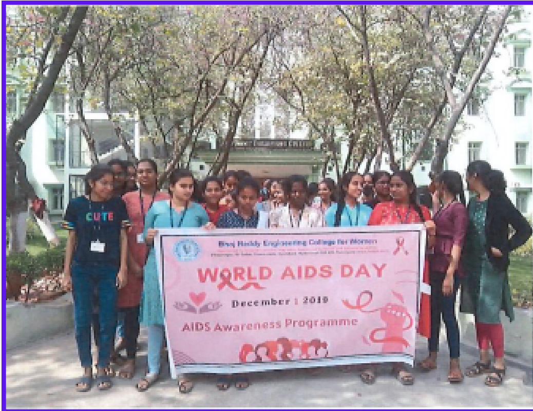
Students participated in a rally

College has organised a rally for the students of all branches on 01 December 2019. The objective of conducting this rally is to build awareness on AIDS among the student community and also the society as we aspire for “AIDS free INDIA”. The theme of 2019 World AIDS day is “Communities Make the Difference”.