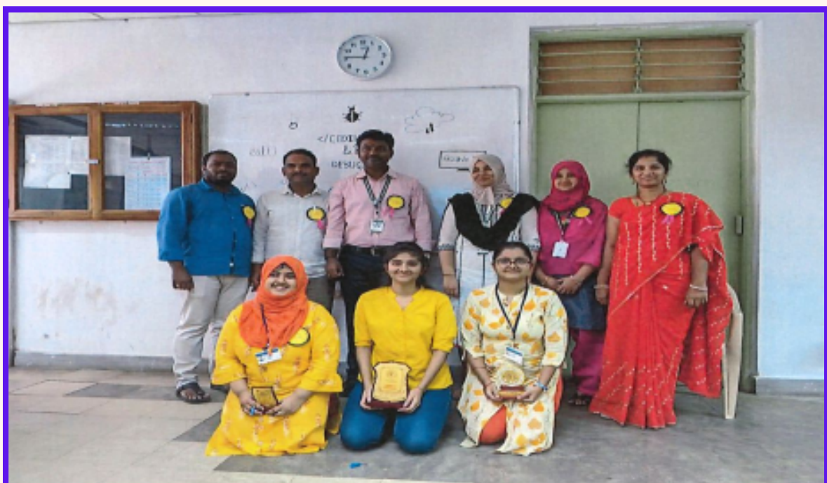
Prize Winners with their Team Members