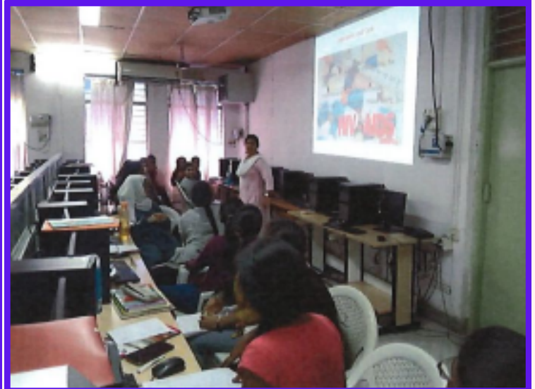
Students gave a seminar on the topic of 'AIDS Free India' as part of the Unnat Bharat Abhiyan