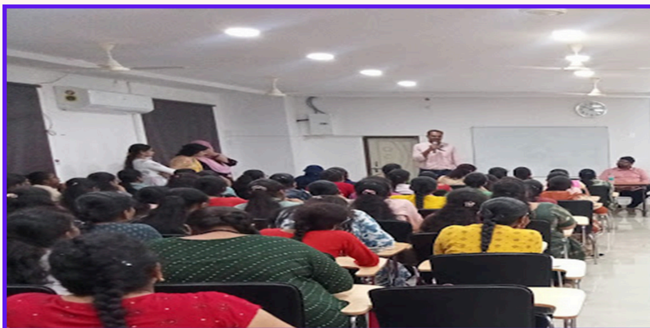
The seminar was delivered by a guest speaker to the students

Students have benefitted a lot through the lecture and interacted with the resource person about the ways to approach universities, GRE, TOEFL, IELTS scores, scholarships and career opportunities.