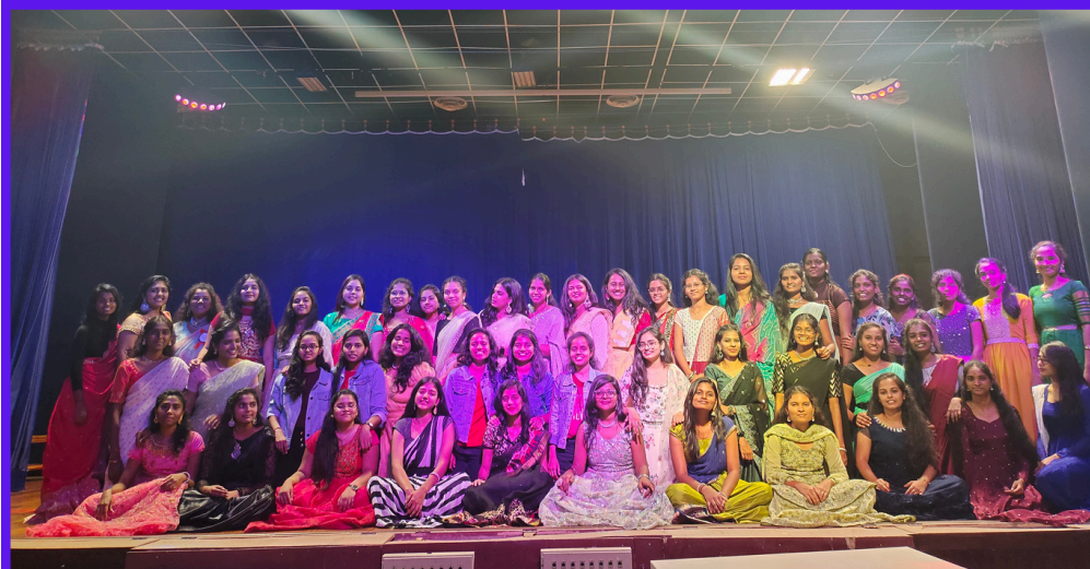
I CSE A Group Photo