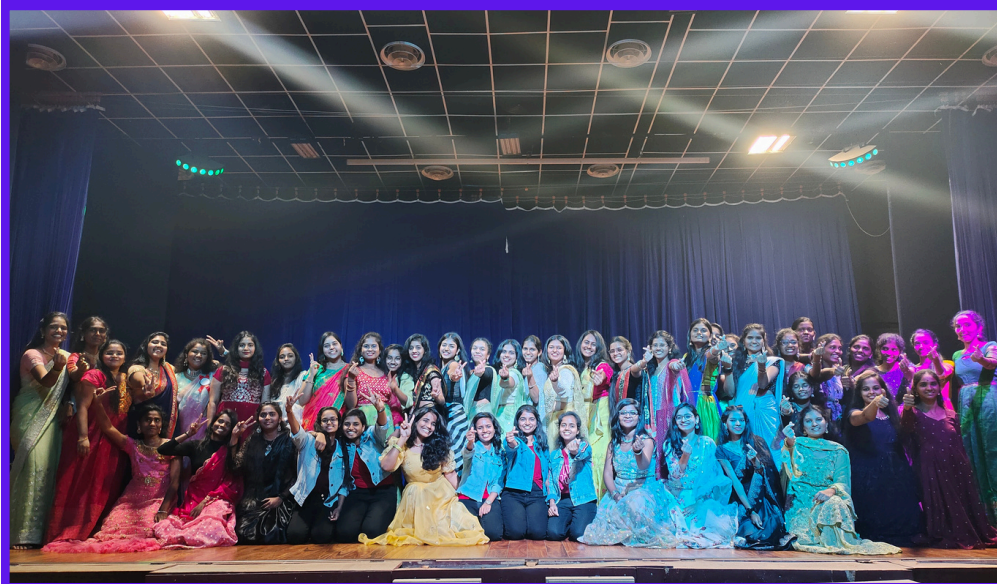
I CSE B Group Photo